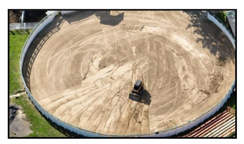
Arena being prepared for a Boone County, IL Mexican Rodeo"Steer Tailing"

There are literally hundreds of cruelty violations at these rodeos. Unfortunately, laws are only as good