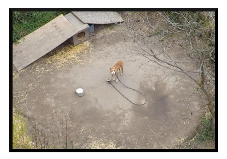
SHARK documenting an Illinois pitbull operation