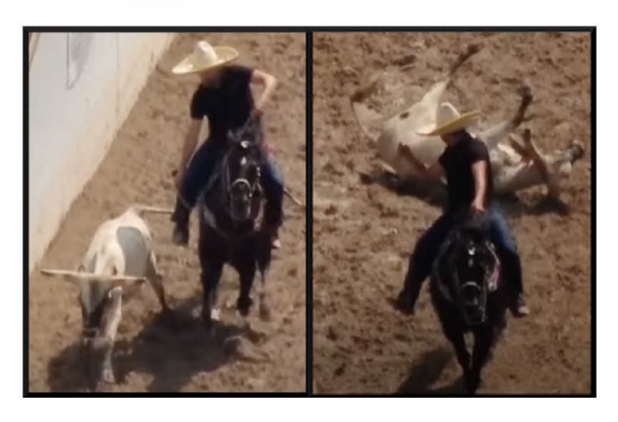
Steers are repeatedly abused during a Boone County, IL Mexican Rodeo in a "Steer Tailing" event

In an October rodeo, one paralyzed steer was dragged out of the arena by his horns, and even this profoundly injured animal was left to suffer. Adding to the cruelty, were the contestants mercilessly beating their own horses for failed runs in which it was those contestants, not their hapless steeds, who failed to perform!