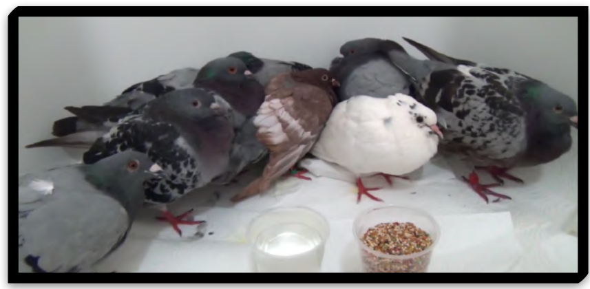
Just some of the many dozens of wounded pigeons SHARK has rescued over the years at pigeon shoots