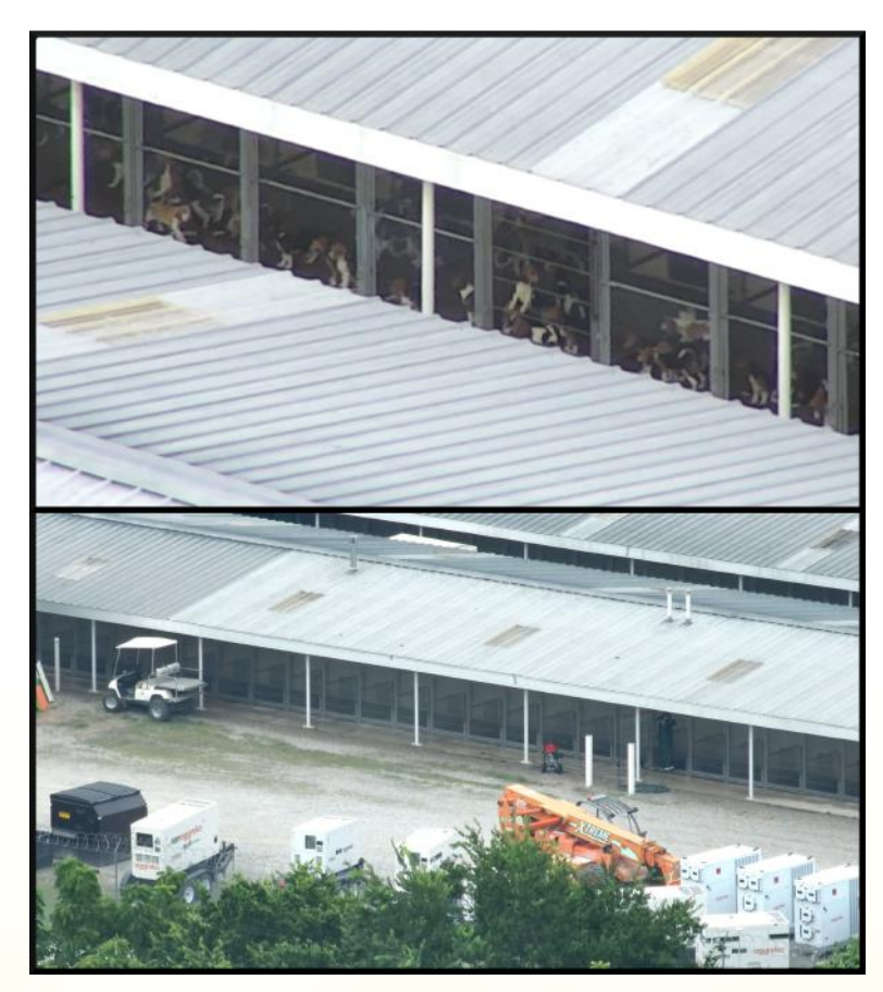
Top photo of Envigo before, and below the empty cages after!

Corporate animal abusers like Covance/Envigo hire lots of well-paid spin doctors to cover up their criminal behavior. But try as they may to lie their way out of trouble, SHARK's drones created an irrefutable public record that no one could spin. Our cameras exposed the truth - a concentration camp of suffering, and a future of more suffering for the hapless beagles.