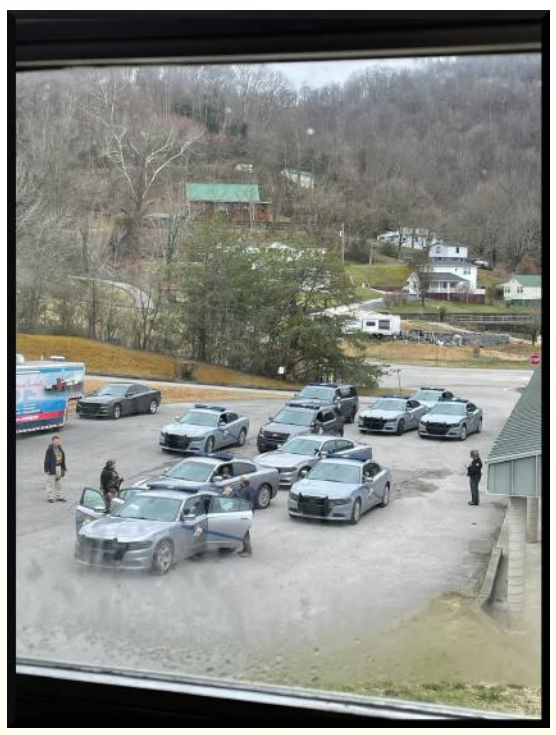
Federal Bust of Kentucky Cockfighters

A small part of Easterling's criminal operation