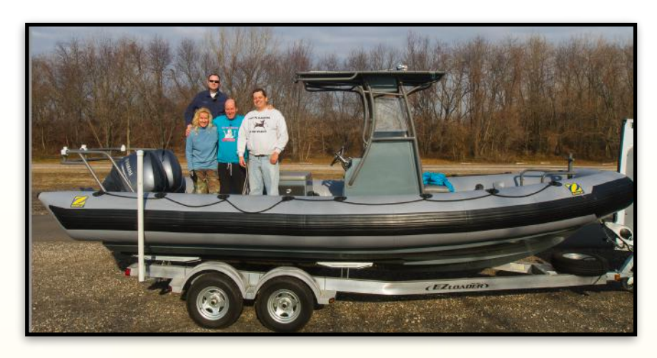
SHARK's boat, the Bob & Nancy, has been used on many important campaigns to save lives, including for cownose rays and cormorants

As we approach the end of another year, I want to thank all of you who have made our efforts, and especially our victories for animals possible. Perhaps the highest profile story was the rescue and adoption of almost four thousand beagles from Envigo. That rescue was only possible because SHARK's drones exposed the horror of what Envigo's prisoners endured.