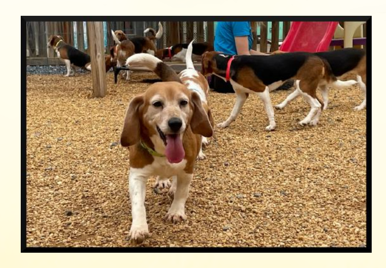
Beagles from the Envigo facility at Homeward Trails Adoption Center.

On October 17, 2022, The Washington Post published a story featuring SHARK's drone work that led to the closing down of Envigo - a massive puppy mill that churned out beagles for experimentation outside of Cumberland, Virginia.