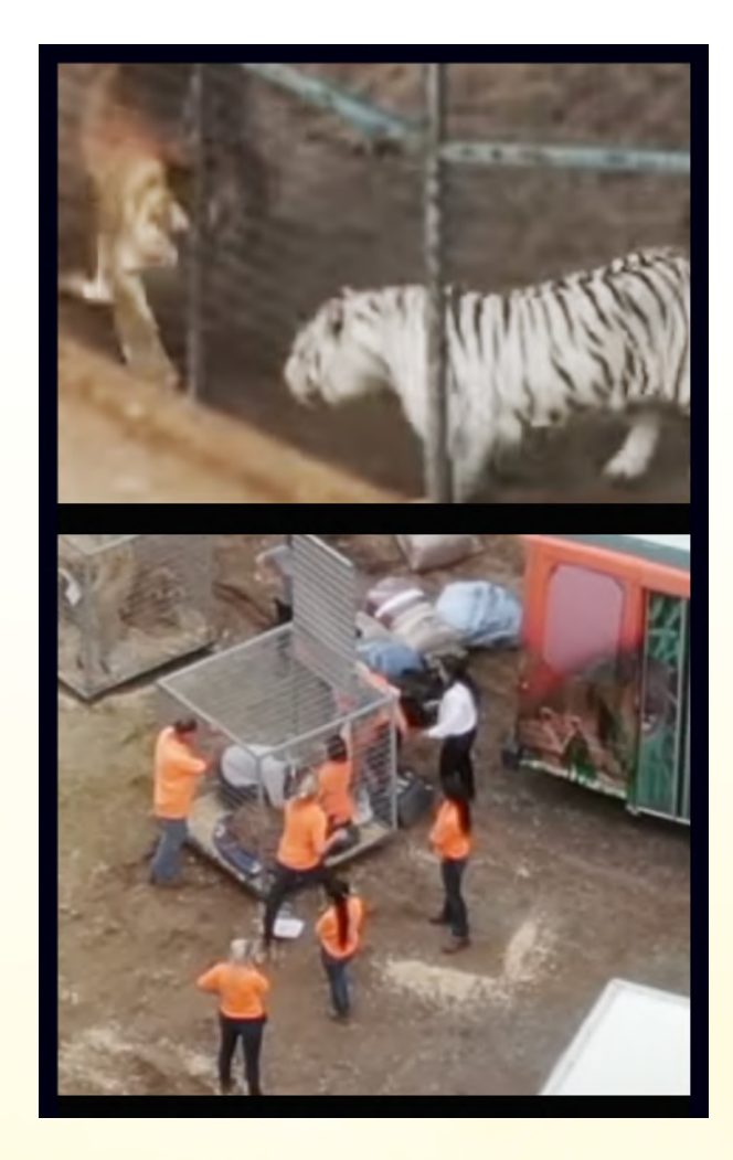
SHARK's drone video of tigers at the Lowe Zoo, followed by the removal of big cats from the zoo

While drones are an invaluable part of our operation, we have many more tools at our disposal, including long-range and undercover cameras, boats, and hovercraft. In the hands of SHARK investigators, the humble video camera has exposed rodeos and other cruelty nationwide.