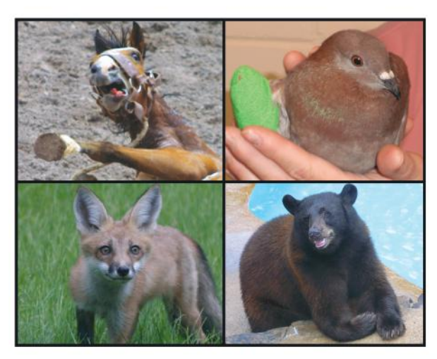
Dedicated to ending the abuse and suffering of animals everywhere