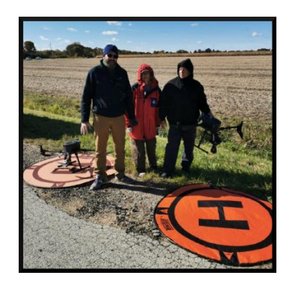
SHARK using drones to document a November 2022 Boone County, IL Mexican Rodeo