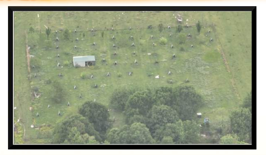
Cockfighting location in Buna, TX

Having received information about cockfight locations in various parts of Texas , we've made our first trip, finding two properties that were quiet at the point we were there. We will continue to monitor these locations and others as funding allows and as we amass more information.