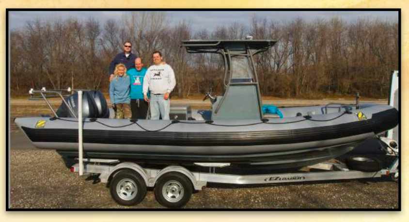
SHARK's boat, the Bob & Nancy, has been used on many important campaigns to save lives, including for cownose rays and cormorants

What you have read in this mailer is just a part of what we do; every day we are working on tips, researching, planning campaigns and producing videos exposing animal abuse. We are active 7 days a week, day and night, traveling across our country, fighting to save lives. No one does what SHARK does, but it is incredibly expensive to maintain this level of activism.