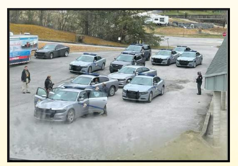
Kentucky State Police vehicles at the Whitesburg Pit bust

There were lots of various law enforcement vehicles and a helicopter - a full-blown federal bust. A local newspaper and others posted images, some of which are included in this mailer. A total of seventeen people were indicted by the federal government. We are told there will be more busts coming.