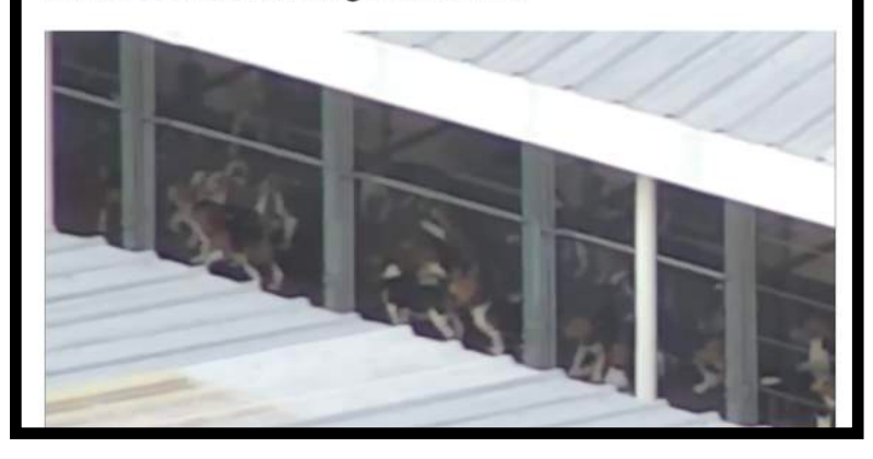
SHARK's drone video has been covered in the news, such as this story that aired on TV in Virginia

'Truly barbaric': Viral video of dogs warehoused for research raising concerns