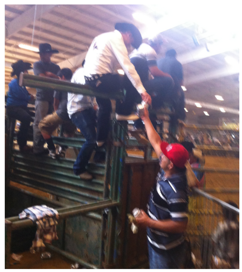
One of the rodeo personnel purchasing a beer while sitting on the bull pen gate.

It cannot be overstated how prevalent the use of alcohol was at the event by those associated with the rodeo. Beer cans where strewn everywhere and was being sold to rodeo personnel right by the arena fence. This use of alcohol was incredibly reckless and dangerous, especially with all the children present.