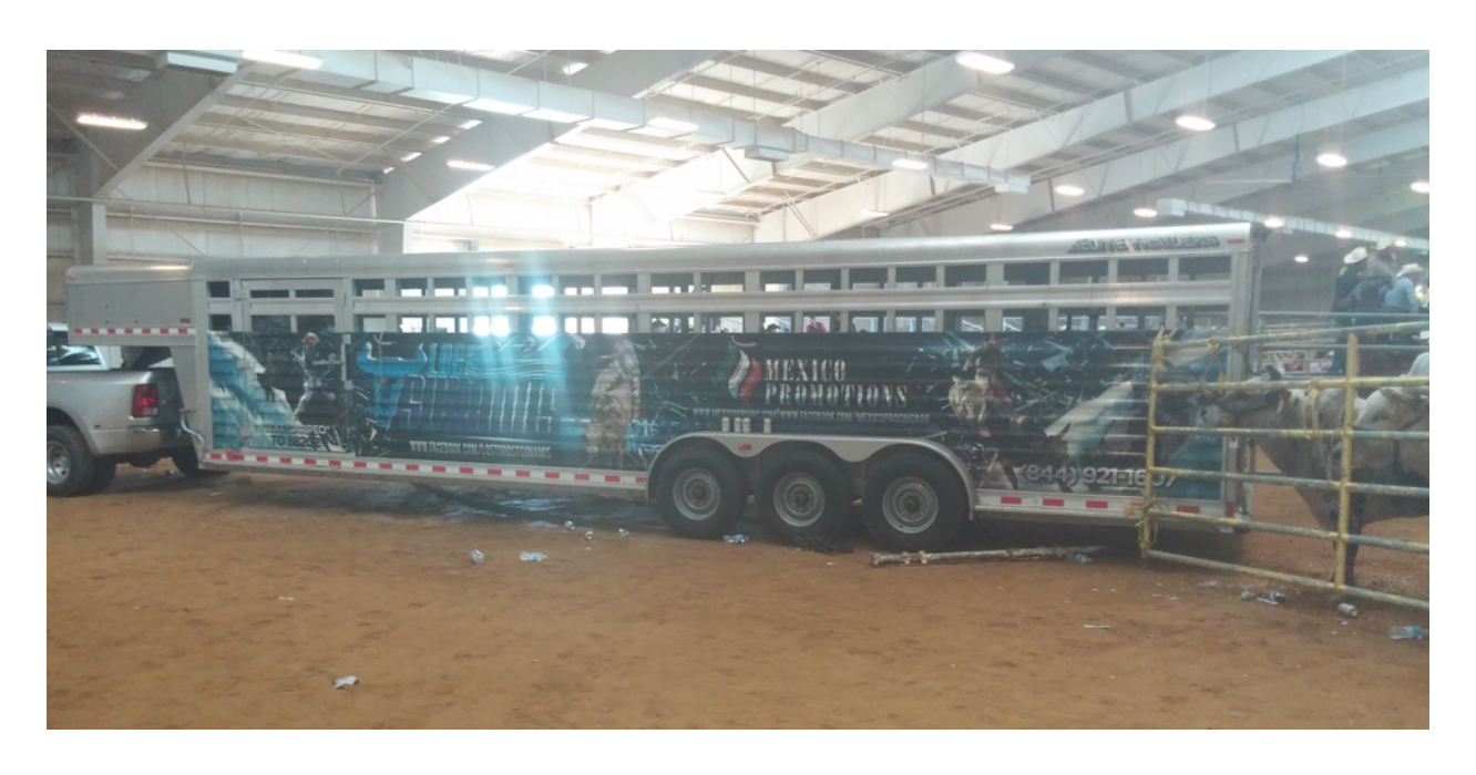
In fact, we found a video published on May 14, 2015, showing this same trailer leaving "Rancho 4 Potrillos" and on its way to the Dream Park.